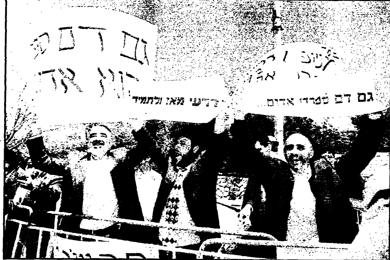
Shas supporters protest against MK Aryeh Deri's pending indictment in front of the Knesset yesterday, while the plenum debates the Bar-On Affair.